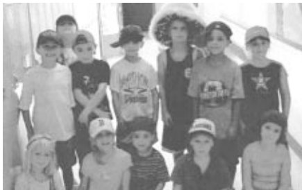
Students enjoyed Hat Day at Emerson and raised money for the Red Cross at the same time.

At Francis Marion Elementary, students held a “Spare Change” fund drive for the Red Cross. Students emptied piggy banks, checked parent’s pockets for change and even gave up their allowance for hurricane victims. At the end of the week, over $1300 had been collected!